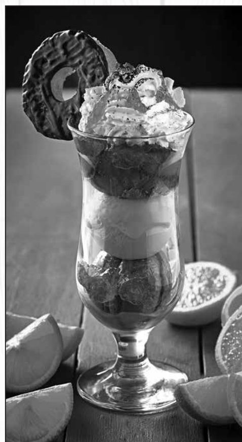
Alcohol (*) Bones (+) Vegi (V) Vegan (VE)

Ask at the bar for our range of Fruit Shoot & Fruit Shoot Hydro flavours. (Not included in the meal deal.)