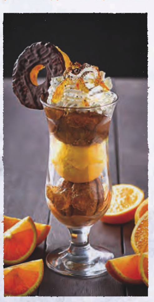
Alcohol (*) Bones (+) Vegi (V) Vegan (VE)

Ask at the bar for our range of Fruit Shoot & Fruit Shoot Hydro flavours. (Not included in the meal deal.)